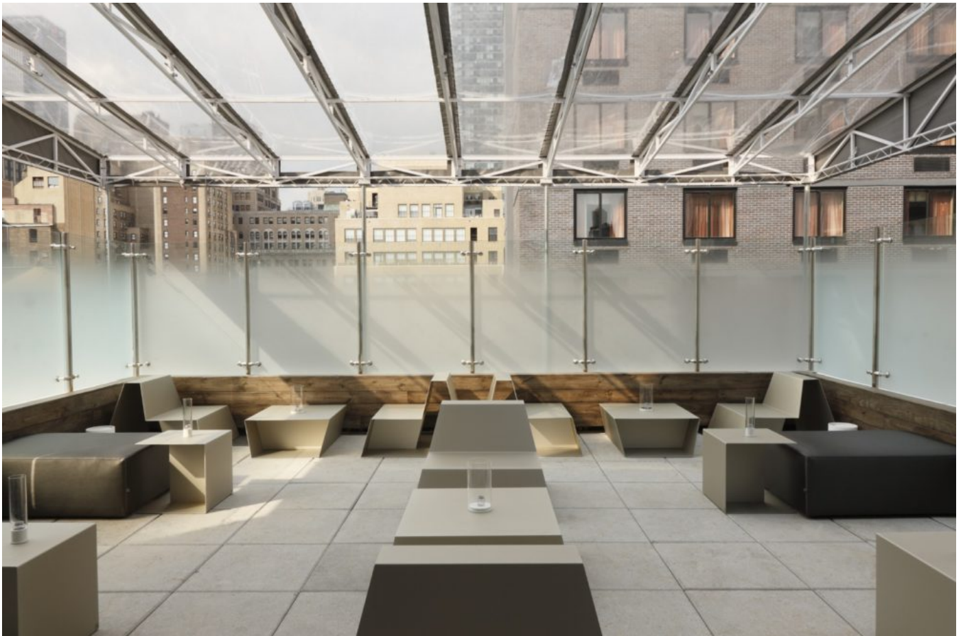
CafèB (New York, USA) by Federico Delrosso Architects